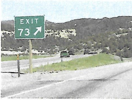
Exit I-70 at mile post 73.

EVERYONE is welcome EVERYONE is welcome EVERYONE is welcome EVERYONE is welcome