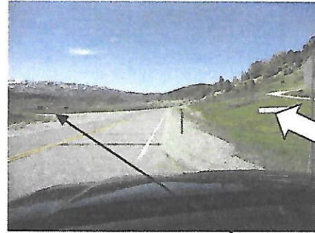
Just past Mile Post 7 you will see a white Accord Lakes sign. Turn LEFT on to a dirt road and head West .

LEFT turn under the freeway and stay on oiled road to Mile Post 7